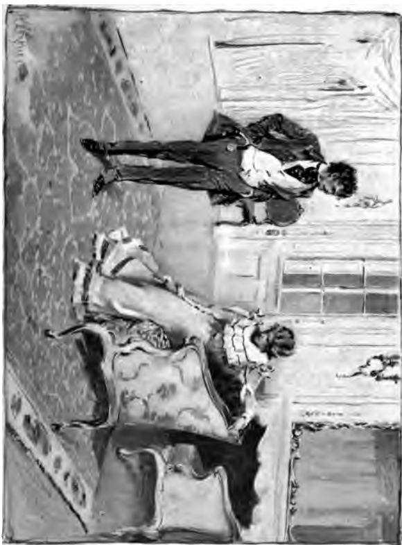
"BELSKY GAVE HER A STUPIDIFIED GLARE THROUGH HIS SPECTACLES."